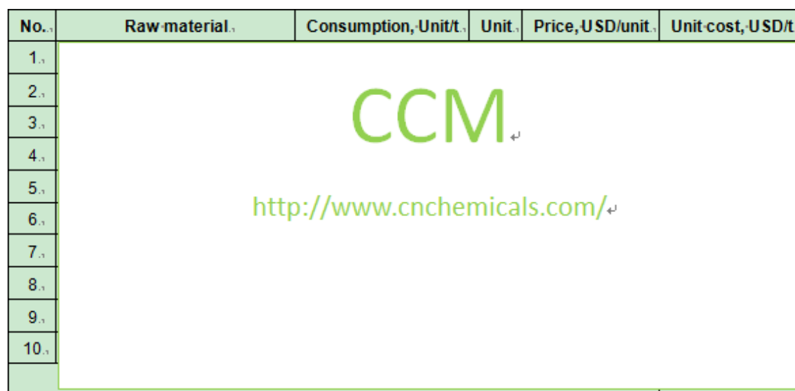
Table 7.1.1-1 Estimated average raw material cost of 90% FG LA in Henan Jindan, 2014